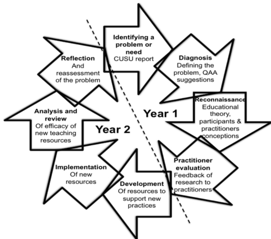
Figure 1 Plant Sciences Pedagogy Project cyclical research structure. The activities were broadly divided into the academic years indicated. CUSU refers to the Cambridge University Students' Union and QAA to the Quality Assurance Agency.