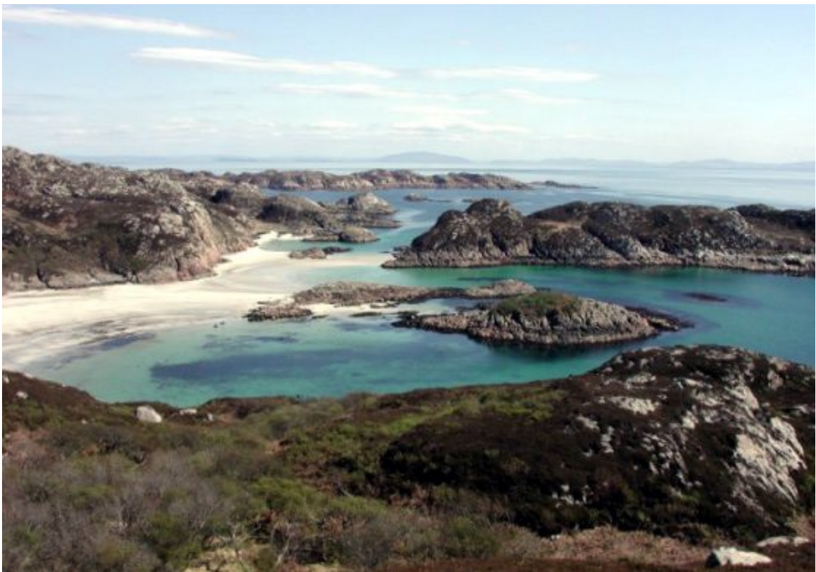
Figure 2. Traigh Gael beach on the southern shores of Tireragan

The web site provides lists of all species that have been identified within the Tireragan boundary fence. We are reasonably confident that the lists are complete for vertebrates