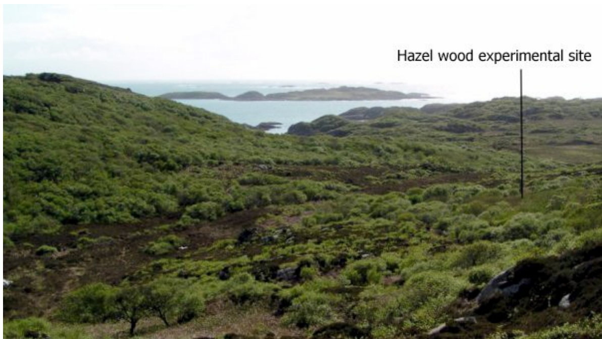
Figure 3: Location of the hazel wood experimental plots

In 1994 grazing by large herbivores ceased in Tireragan with the erection of a perimeter deer fence and the removal of red deer and sheep. Past grazing management practices such as muirburn also ceased and natural woodland regeneration was encouraged. However, some of the Tireragan woodlands are quite old, with little sign of internal regeneration, perhaps reflecting the consequences of previous grazing and management. We want to investigate how the woodland flora and fauna will respond to the experimental clearance of some mature trees. Because most changes are likely to be quite slow we have established permanent quadrats that can be monitored over a long period of time. Four experimental sites were identified on the slopes of Torr Fada (Figures 3 & 4). At each site permanent quadrats were established and marked to allow continuous recording over a number of years. Full details of the experimental protocols and data are available from the project web site. Briefly, we provide fine resolution photographs (1 mm pixel resolution) of the permanent quadrats, details of nearest trees to each quadrat and detailed information on felled trees (including sections through stems and photographs of the rich epiphyte flora).