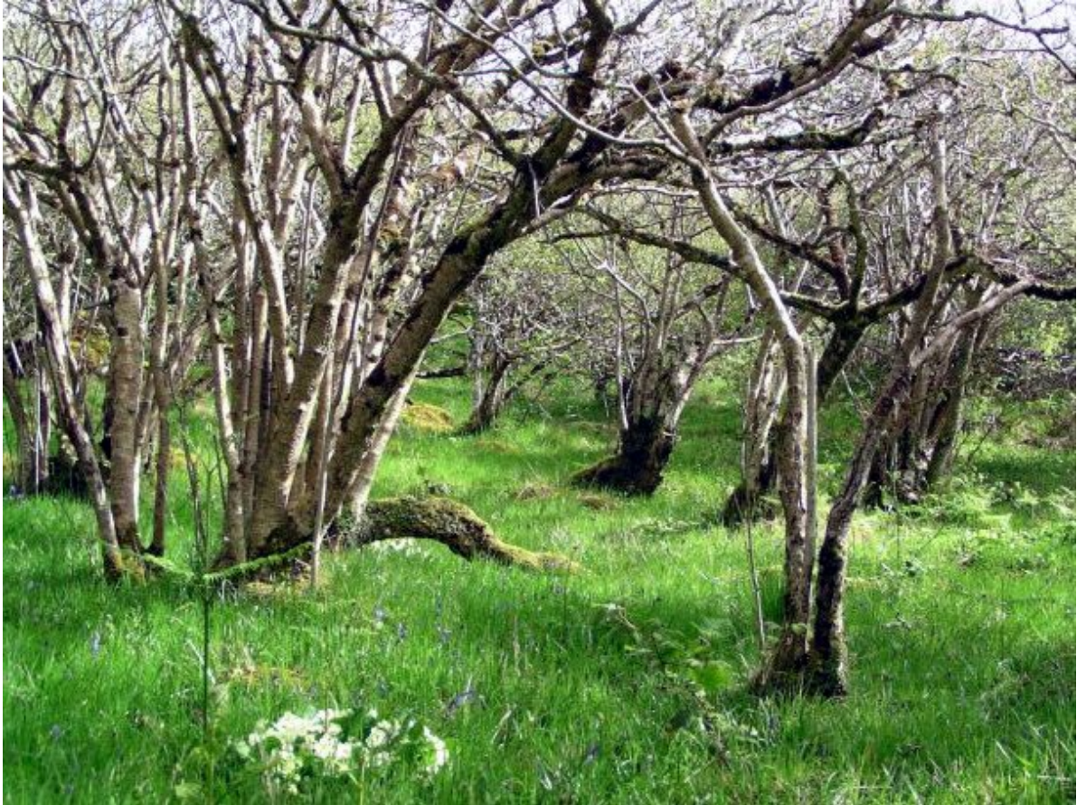
Figure 4 Hazel wood experimental site in early May 2003

Because we do not expect rapid changes we have also included a small number of other datasets that may be of value for data analysis exercises. The first three relate to the Tireragan site, others are from elsewhere on the island or other Hebridean islands. Html and Excel versions are available for most.